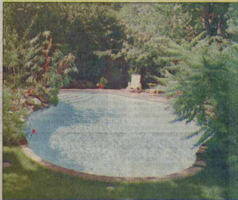
TEDD CHURCH, GAZETTE

With a pool, the back yard becomes an oasis for swimming, dining, sunning and quiet contemplation. Page F3