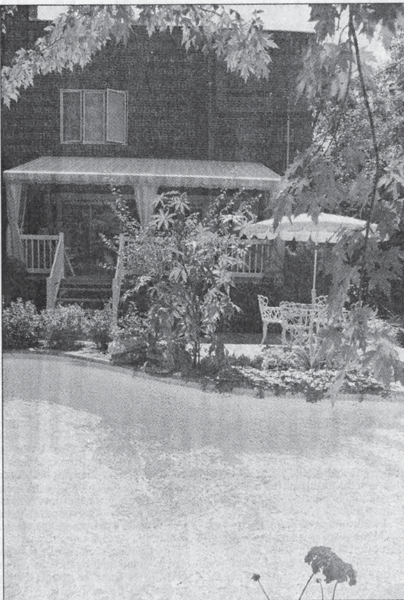
TEDD CHURCH, GAZETTE

❖ Breault et Monette Landscape Architects, 733-5180.